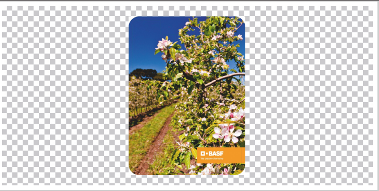
Positions I - Whole surface